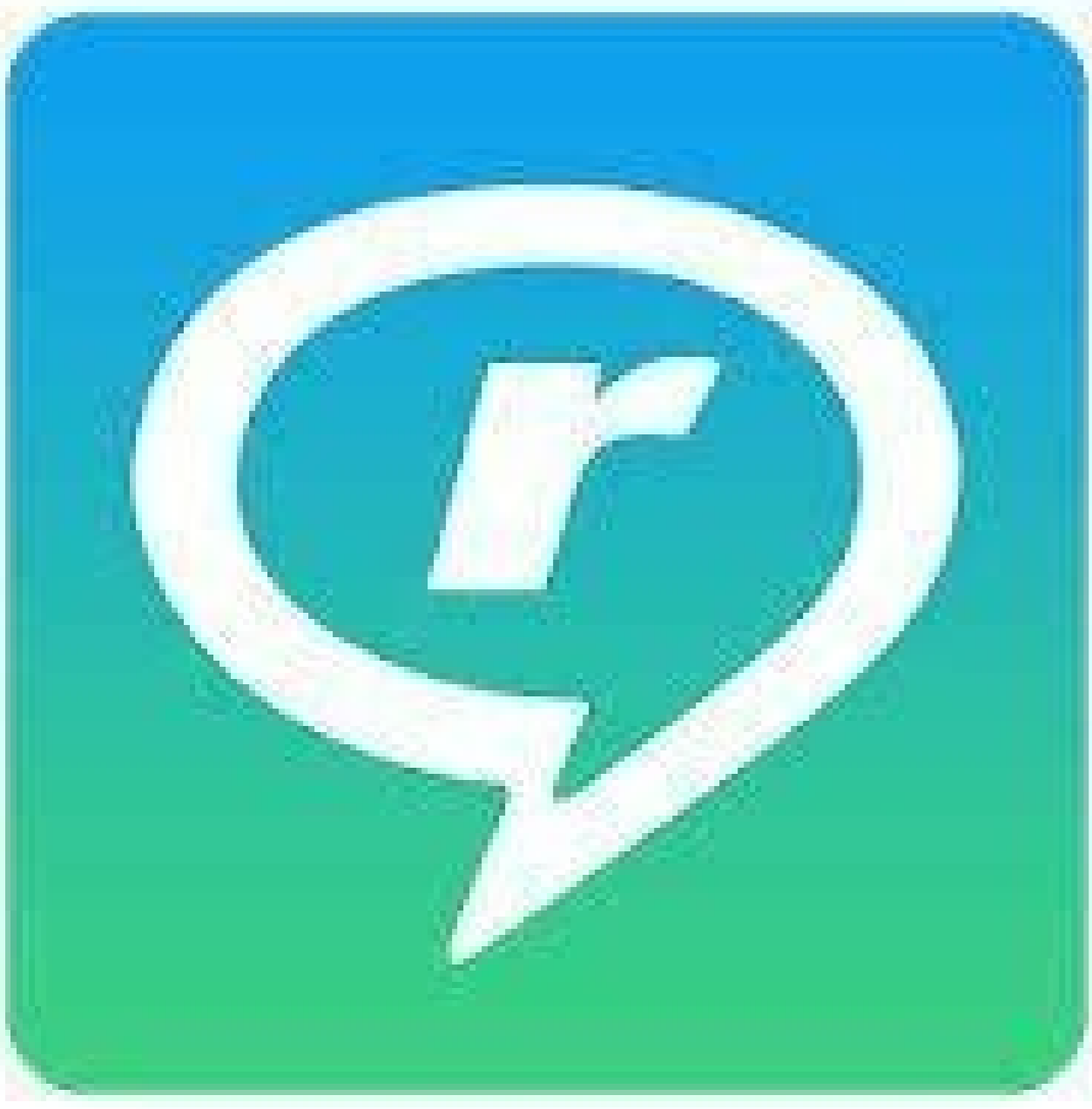
Acapella app for android free download. Free acapella apps for android. Best free acapella app for android. Acapella free download for android.